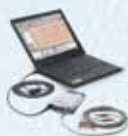
PC-Based Resting ECG