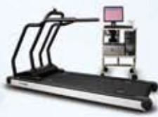
Exercise Stress ECGs